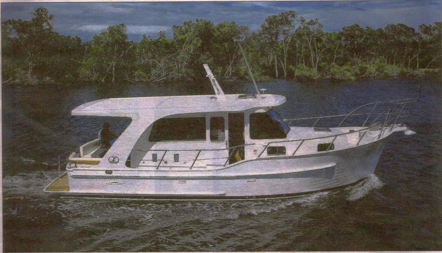
The Integrity 330 Sedan cuts along Coomera River downstream from Sanctuary Cove.